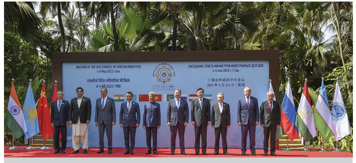
From the SCO meeting of foreign ministers held in India on May 5, 2023. (Xinhua, 2023)

sovereignty and ensure that their national interests are taken into account in interaction with other participants in international relations.