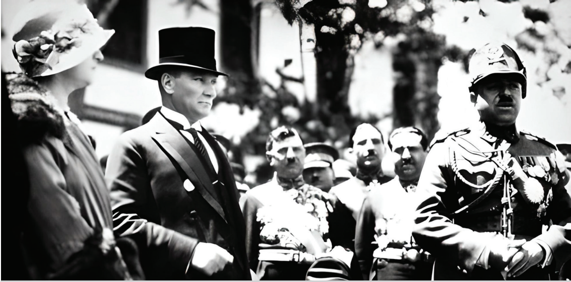
Atatürk and King Amanullah Khan of Afghanistan, 1928, Ankara (TCCB, 2023).

The aforementioned states share several salient attributes, including a robust lineage of imperial and state traditions. Their historical trajectories have borne witness to experimental endeavors that facilitated the dismantling of antiquated norms and the establishment of novel paradigms. Moreover, they possess a reservoir of capability, erudition, and cultural heritage that positions them as potential agents of transformative change.