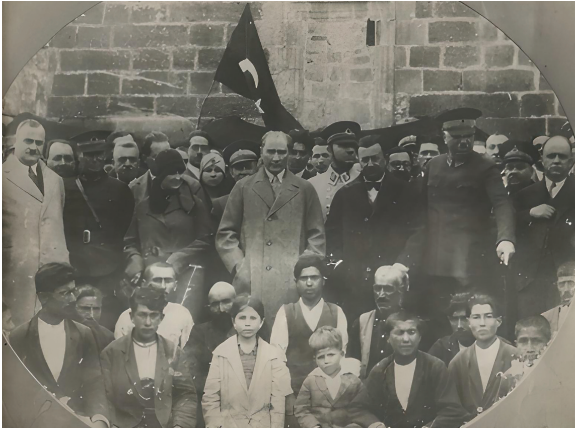
Atatürk and Turkish citizens.

“This hope lived with them until the end. But it appeared in my mind as a constant danger. It remained alive and fresh, and I began to govern with it in mind. ‘İsmet Pasha always governs with the mindset of Lausanne. However, the world has changed,’ and all kinds of breaches were opened with an indiscriminate financial policy. This is where the real mistake was made.”