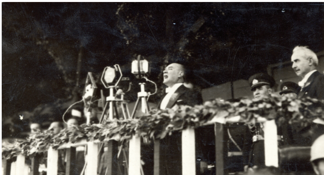
Atatürk made a speech on the 10th anniversary of the Republic, 29 October 1933 (ATAM, 2023).

This can be counted as one of the characteristics of the Turkish Revolution. We know that the leader of the revolution later took a special interest in our Turkish language, devoted a lot of time and effort to it, and resisted imperialism in that field as well. It is an important building block that makes a nation a nation. The Language Revolution is one of the deep-rooted and important aspects of the Kemalist Revolution.