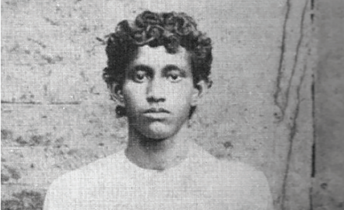
Khudiram Bose is one of the Bengali revolutionary leaders who fought against the British rule in India (Indian Culture, 2023).