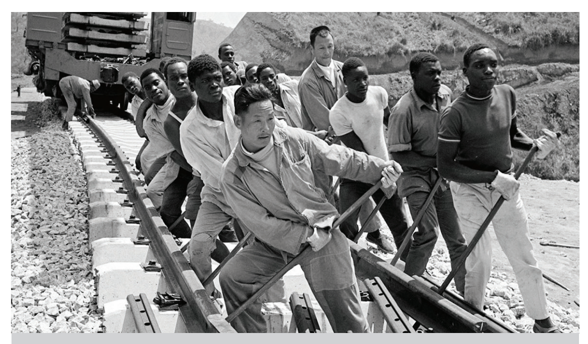
In 1976, Chinese and Tanzanian workers lay track on the Tanzania-Zambia Railway. The 1860.5 km railway is a milestone in China-Africa friendship.

The financial commitment extended to the China-Africa Development Fund, initially established during the 2006 FOCAC summit, experienced a significant increase from USD 1 billion to USD 5 billion. Moreover, China entered into bilateral agreements on investment protection with 32 African nations and established Joint Economic and Trade Commissions with 45 others. An investment totaling approximately USD 1.806 billion was injected into 53 projects, part of a broader initiative encompassing 61 projects across 30 African countries under the China-Africa Development Fund.