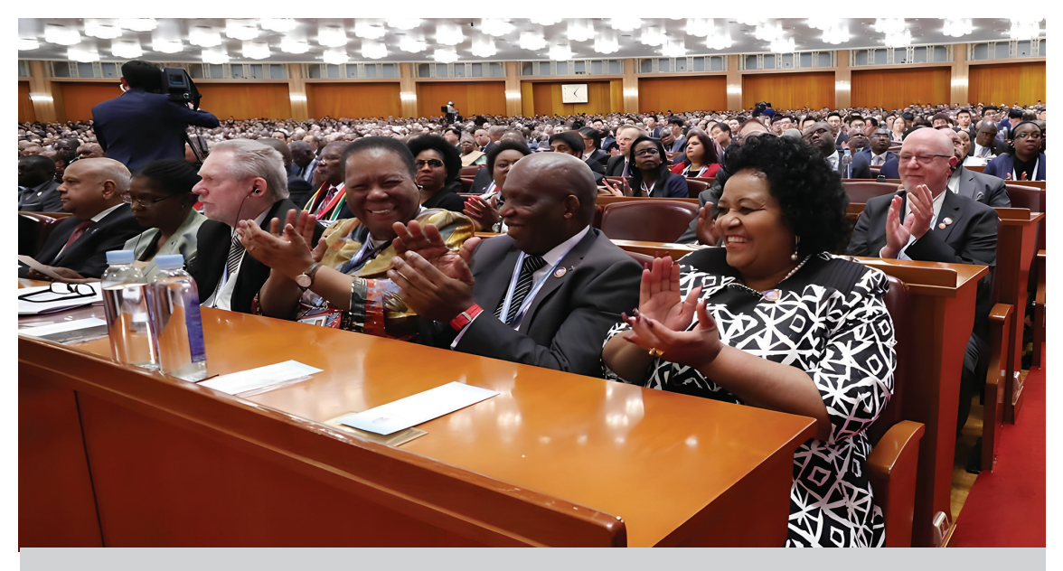
3 September 2018, Great Hall of the People, Beijing, China (Photo: Liu Weibing, Xinhua, 2018).

Africa demonstrates unwavering support on issues central to China's core interests, contributing to the stability of the amicable relations between the two. Amid the unprecedented challenges posed by the COVID-19 pandemic, China not only faced immense pressure in combating the outbreak domestically but also extended substantial assistance to African countries and the African Union. This assistance included the provision of approximately 5.4 million face masks, over a million test kits, and thousands of personal protective gears to bolster Africa's resilience against the COVID-19 pandemic. Similarly, Jack Ma Foundation initiated a collaborative effort between the private and public sectors, contributing around 4.6 million masks, 500,000 pairs of