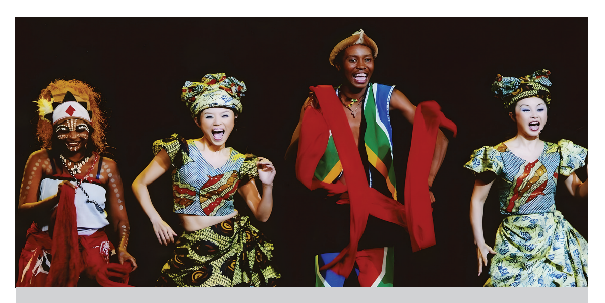
At the 2009 Beijing Summit Gala Night, Chinese and African dancers performed together (Photo: FOCAC, 2009).

As a result, China has been Africa's largest trading partner for the 14 years since 2009. According to the China-Africa Trade Index, China's trade with Africa rose from less than 100 billion yuan in 2000 to 1.88 trillion yuan in 2022, posting a cumulative increase of more than 20 times, with an average annual growth rate of 17.7 percent (Xinhua, 2023).