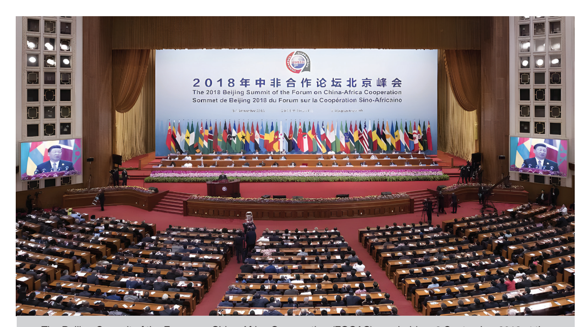
The Beijing Summit of the Forum on China-Africa Cooperation (FOCAC) was held on 3 September 2018 at the Great Hall of the People in Beijing, capital of China.

en China and Africa. By May of that year, all African UN member states had officially recognized the People's Republic of China as the sole legitimate representative of China, with Eswatini (Swaziland) being the only exception due to its relations with Taiwan. Remarkably, more African leaders attended the FO-CAC summit in Beijing in early September than the parallel UN General Assembly meeting. Knowing China's offer of global public goods has become a key driver for sustainable development in Africa, majority of leaders opted to attend the 2018 FO-CAC Summit to secure bilateral agreements. During the summit, President Xi unveiled eight significant initiatives to guide Sino-Africa cooperation. These initiatives encompassed industrial promotion, infrastructure connectivity, trade facilitation, green development, capacity building, healthcare, people-to-people exchanges, and peace and security. In support of these pillars, China committed an additional USD 60 billion economic package.